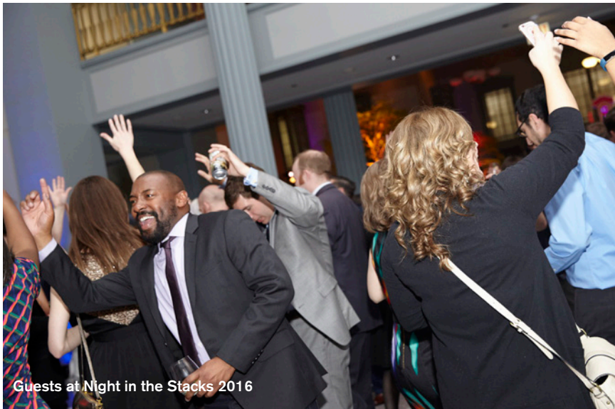
Guests at Night in the Stacks 2016