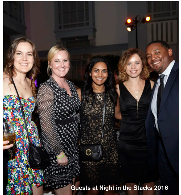
Guests at Night in the Stacks 2016